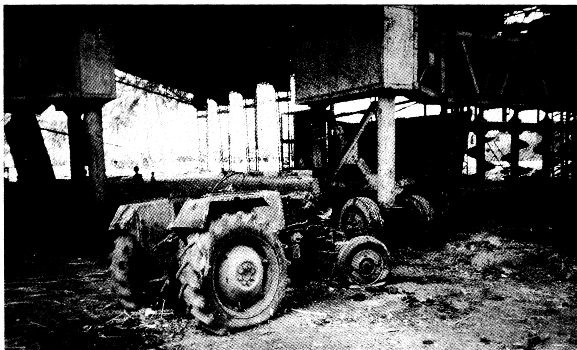
Figure E-2.1 A view of the abandoned composting plant at Deonar, Mumbai.

Before reviewing the reasons for the failures of these plants, it is important to ask what can be learned from such retrospection. Are there lessons for today? Is it possible that the same mistakes could be made, or are being made, again? Yes, there is a strong possibility that some of these mistakes could be repeated, and so it is can be very beneficial to review the causes of failure of India's large, mechanised composting plants and consider how these causes might be repeated in the programmes of today. The list in the box below comprises suggested reasons for failure, because the writer has not had the opportunity to study the case histories of many plants in India. The list is based on the observations of others and experiences in other countries. A more detailed investigation of the reasons for the closures of these plants would, no doubt, produce some instructive conclusions.