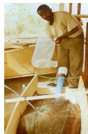
Figure 2. Collected gas being shown in a plastic bag after four weeks of digestion