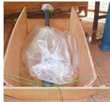
Figure 1. Overview of the digester being checked for leakages with water

A 1 m wide and 2.34 m long polyethylene sheet, with open ends, was laid as bedding on the floor of the trough. The polyethylene sheet was folded at both ends longitudinally and pushed gently through PVC pipes (0.65 m long inlet pipe of 0.11 m diameter; and 0.54 m long outlet pipe of 0.09 m diameter). The edges of the polyethylene were wrapped round the file-smoothed mouth of the pipes and fastened in position with rubber bands. At every stage, care was taken to avoid having a hole in the polyethylene sheet.