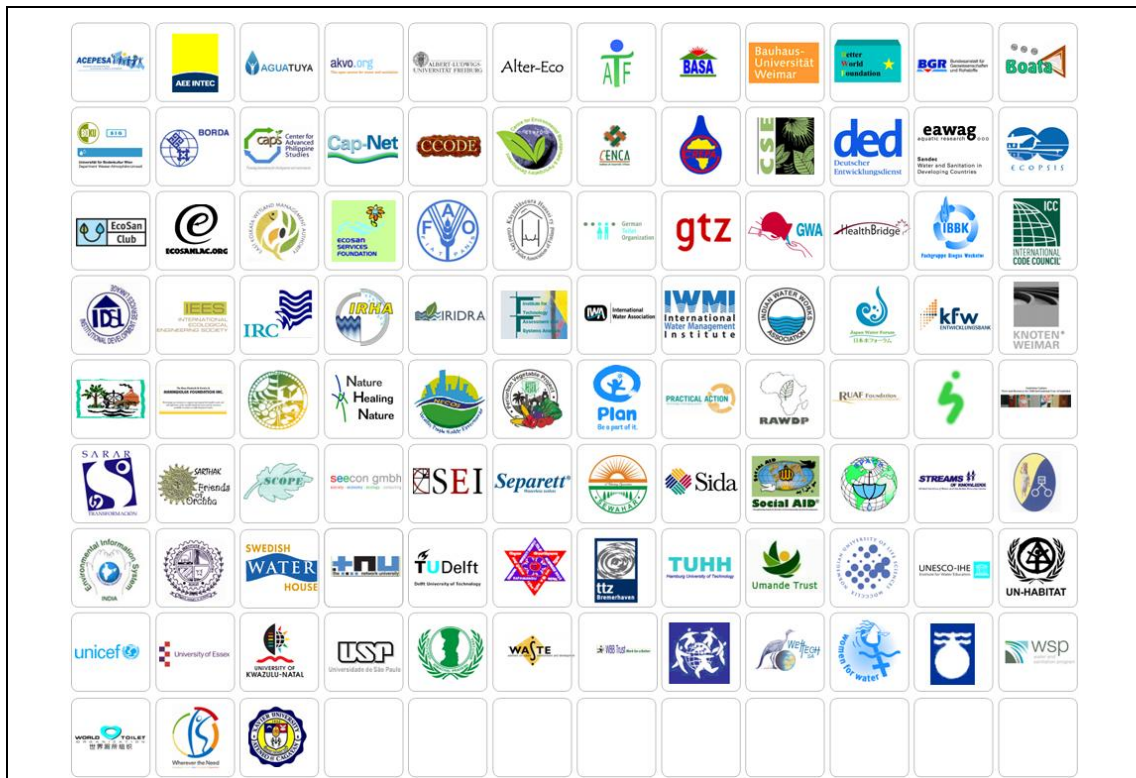
Figure 1. Overview of SuSanA partners (October 2008)