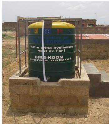
Figure 5. Plastic urine storage tank in Ouagadougou, Burkina Faso installed as part of EU-funded project ECOSAN_UE, Sept. 2008