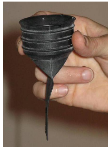
Figure 2. Flat rubber tube (in Keramag Centaurus model shown in Figure 1).