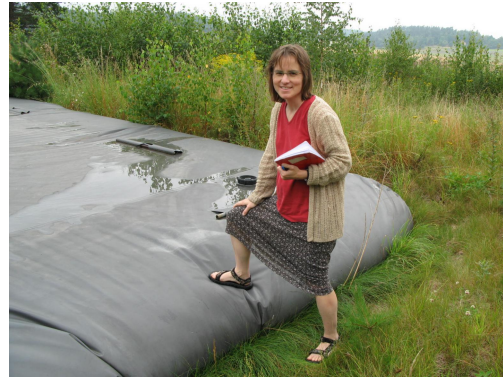
Figure 6. Urine storage tank made of a PVC bladder (3 x 150 m 3 ) at Lake Bornsjön near Stockholm (Sweden), Aug. 2007