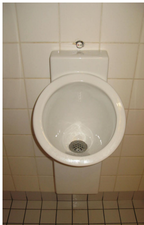
Figure 1. Waterless urinal of Keramag, Germany (model Centaurus).