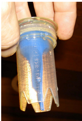
Figure 3. Transparent EcoSmellstop (ESS) unit showing the blue silicon curtain one-way valve inside.

The production of the ESS element is fully automated using industrial robots. At the end of the assembly line 100% of the ESS units are tested aerodynamically. A pre-set airflow is channelled through the ESS element causing a sound. A frequency measuring device set to a narrow tolerance will eliminate sub-standard units. This patented ESS unit is used by the companies Addicom, Kellerinvent AG and F. Ernst Ingenieur AG (see Table 1) since 2006.