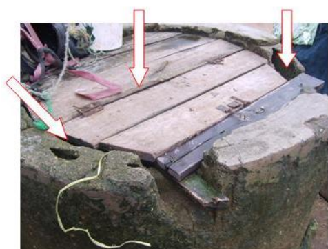
Photograph 1. Fully covered well with gaps within planks, and see-through openings between cover and head wall

Experience with this study however shows that ‘yes or no’ sanitary scoring approach assumes a rigid correspondence between the assessment criteria and the observed sanitary faults. Hand dug wells, which are generally expected to be completed with hand pump, for instance, are not. Well covers exist in varying degree of materials and covering range (Photographs 1 and 2). In the study area, there is also no known regulation for especially self supply well design, source and water safety. Water source construction, user activities and source handling of self supply sources are typically a function of source ownership, investment capabilities and water use priorities. In which case construction quality, design and source handling varies. The extent of variation in any of observed sanitary faults do not therefore usually fit a ‘yes or no’ assessment score method, but arguably captured in the 1 – 5 scoring approach.