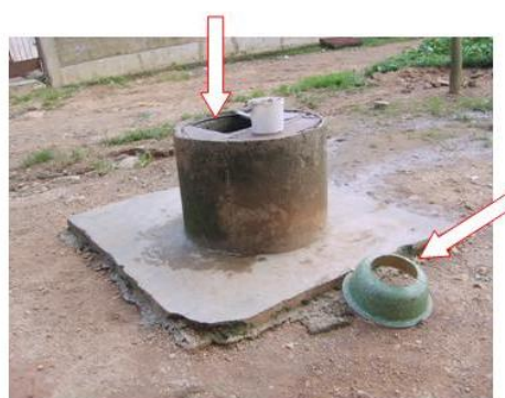
Photograph 2. Partially covered well; the perforated bowl cover used for the covering of the un-covered part is placed next to the well

Examples of self supply dug wells showing varied degree of covering; Source: Field data