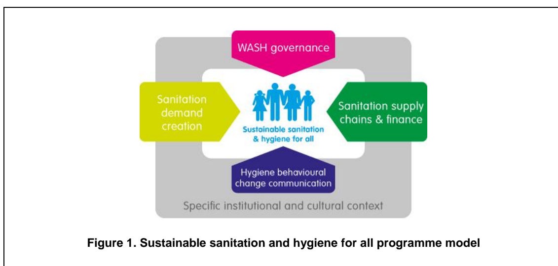
Figure 1. Sustainable sanitation and hygiene for all programme model

Outcomes are monitored using one shared performance monitoring framework for all countries where the programme is implemented. The programme has four integrated components supported by performance monitoring and learning as illustrated in Figure 1.