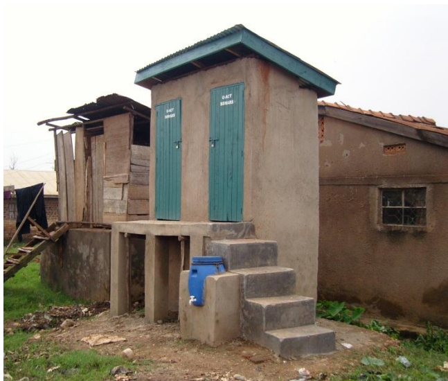
Photograph 1. Example of a U-ACT toilet (right) next to the old facility (left)

Working with a high-quality, local NGO, and offering well-built sanitation facilities enabled us to construct over 150 VIP latrines for 1,500 people, which, as can be seen in Photograph 1 and as indicated by our regression results, are a significant improvement over the currently available facilities.