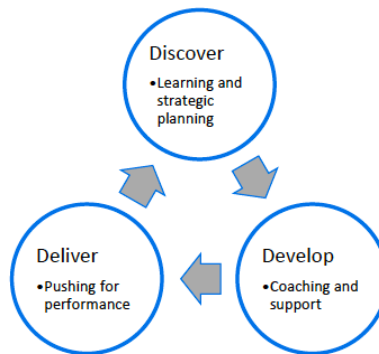
Figure 1. Leadapreneur iterative development model

The target group are elected local government representatives or commune councillors. The first local government election was held in 2002. The third and most recent election was held in 2012. Approximately 50 percent of commune councillors have held their positions since 2002. The average age was over 50 years and most commune councillors had not graduated primary school. Three matched districts were identified from one province in rural Cambodia. Two districts were randomly assigned as ‘treatment’ districts. Typically for many training activities, good attendance is assured through the payment of per diems and travel allowances. In this program, participants self-selected and paid an upfront nominal, non-refundable fee of US $30. The initial leadership development model was linear in nature. As a greater familiarity with the audience and the environment developed, an iterative model emerged.