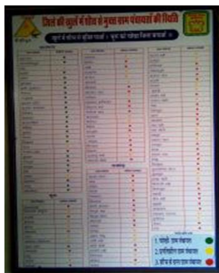
Photograph 1. ODF monitoring board displayed at Collector's office

Additionally, the successful districts monitored the campaign processes and community mobilization initiatives through regular meetings at various levels. At the block level, officers facilitated monthly meetings of nodal officers and other key stakeholders to review progress and plan future actions of the campaign. At the district level, collectors chaired weekly meetings of key officers to review the progress and to give necessary directions. In Churu, the District Collector installed a monitoring board in front of his office with the names of all GPs highlighting ODF Gram Panchayats in green (Photo 1). This not only communicated the priority of the district administration but also facilitated effective monitoring of ODF outcomes.