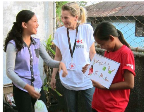
Photograph 3. Training Red Cross