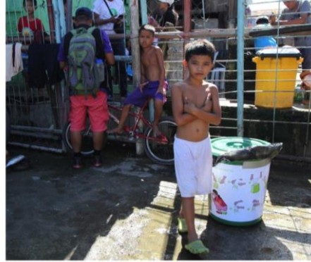
Photograph 5. Community Collection