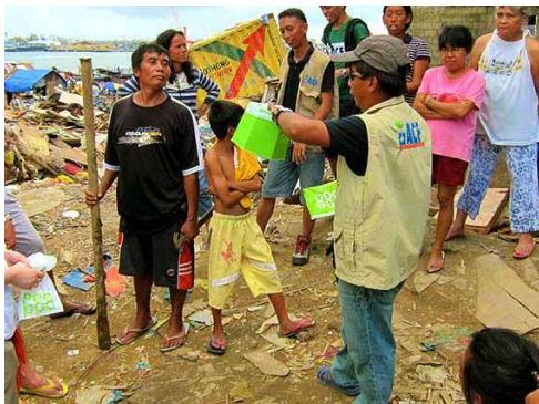
Photograph 2. Community meeting ACF