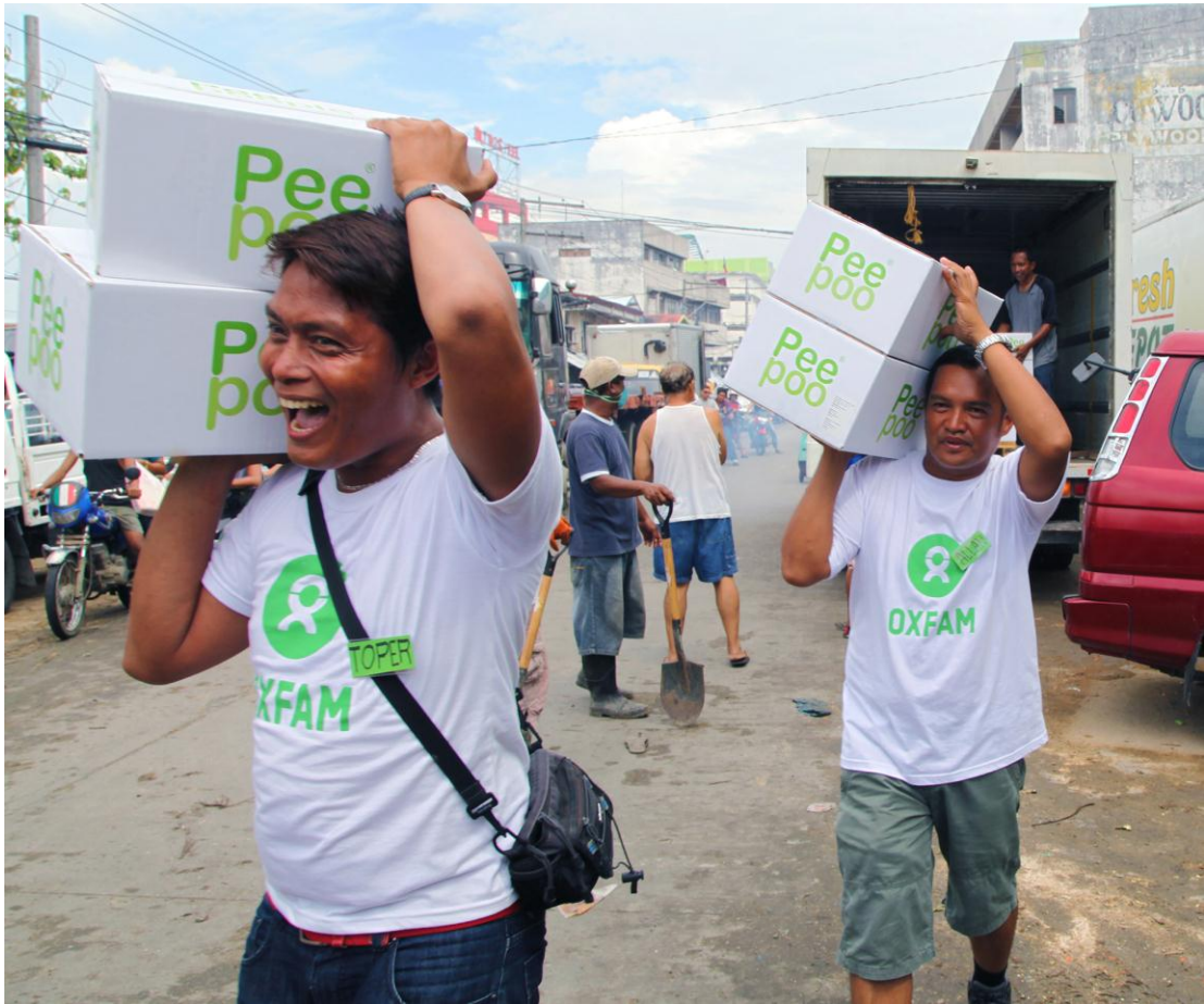
Photograph 1. Distribution Oxfam