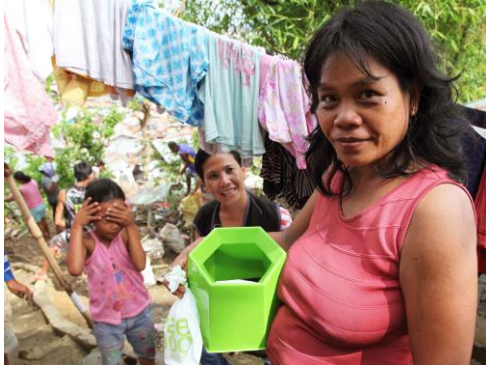
Photograph 4. Beneficiaries with Peepoo