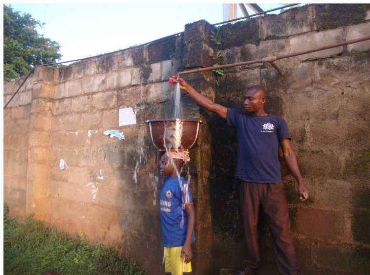
Photograph 3. Water being sold at borehole water shop

Generally, this supply is not continuous. Water supply here is divided into morning session between the hours of 6:30 am and 8:00 am as well as evening session between the hours of 5:00 pm and 7:00 pm. Water is sold in containers, jerry cans and drums. This source of water is cheap, but the quantity and the quality of water are not guaranteed all over the year. On the average, 20 Litres of water goes for US$0.1).