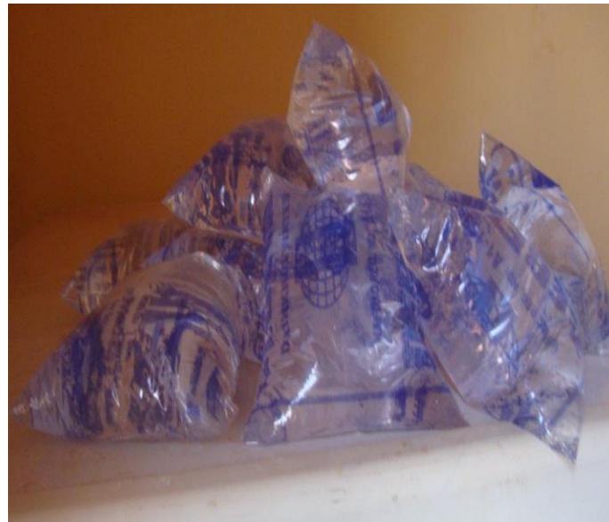
Photograph 2. Sachet water