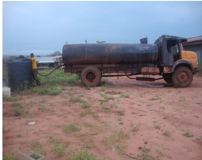
Photograph 1. A water tanker supplying water to a household

clamped down on the producers of unregistered sachet water by closing down the production centres. This has engendered the unregistered producers to meet the requirements for registration. The major requirement for registration is the full inspection of the production premises, assessment of the equipment for production and also the source and quality of water to be used vis-a-vis the required treatment. In terms of cost a sachet of water (commonly called pure water) costs US$0.2 per 50 cl. This sachet water is handy and readily available shop outlets as single units or in a bag of 20 sachets. Bags of sachet water are so commonly available and cheaper when compared with bottled water cartons. Photograph 2 shows a collection of sachet water used by a household in Idah town.