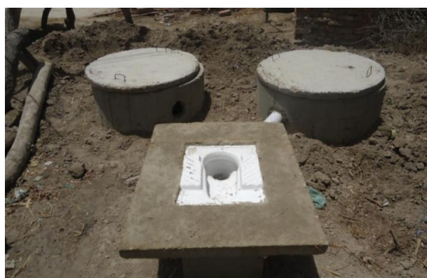
Photograph 1. Easy Latrine construction