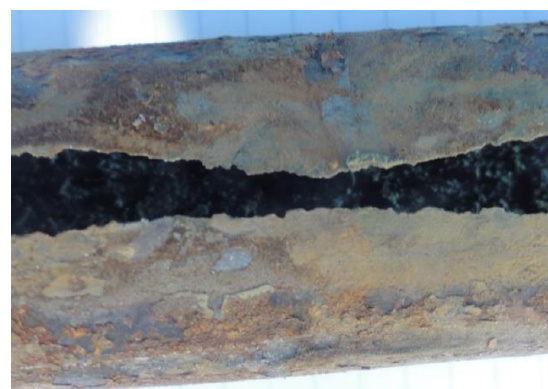
Photograph 2. Perforation of a rising main from corrosion