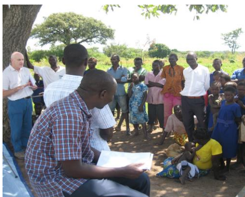
Photograph 1. Well point community discussions in Amuria District