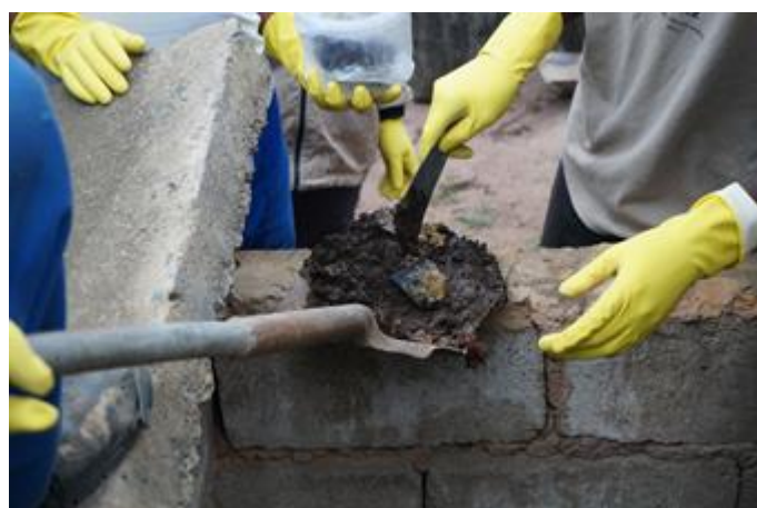
Photograph 1. Collection of faecal sludge sample for analysis in Durban (South Africa).

pH is a measure of the acidity or basicity of a matrix (i.e. liquid or semi-solid). It is a critical parameter in faecal sludge characterisation with many practical applications. As reviewed by Niwagaba et al. (2014) the pH of FS (from septic tanks) is usually between 6.5 to 8.0. pH plays an operationally important role during different biological treatments (e.g. composting or anaerobic digestion), as microbial processes are many times sensitive to specific pH ranges. Such processes often require near neutral pHs. Also, in the chemical treatment of faecal sludge (e.g. lime stabilisation) monitoring of this parameter is important. Substantial pathogen inactivation of pathogens can be achieved at pHs of 12 or higher (Polprasert & Valencia 1981).