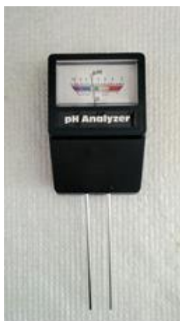
Photograph 2. Dual probe soil pH meter used in this study.

A commercially-available dual probe pH Analyzer (Luster Leaf®, USA) soil pH meter (Photograph 2) was tested in acidic and alkaline conditions. To this end, the soil pH meter was placed in a 1 litre of deionised water in a beaker that sat on a magnetic mixer. The solution pH was adjusted to different acidic pHs with a HCl solution until a target pH of 3.0 was reached. The pH of the solution was also continuously measured against a “standard” HQ40d pH meter (HACH, USA) that was operated and calibrated according to the manufacturer’s instructions. The soil pH meter was then rinsed and the deionised water changed prior to the subsequent alkaline condition testing. A similar test procedure was followed with the pH being gradually increased from neutral using a NaOH solution until a target alkaline pH of 9.0 was reached.