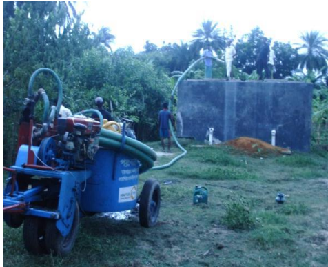
Photograph 1. Vacutug used by Conservancy Department

However, there is limited transport equipment and with no incentive to safely dispose, the workers typically apply the principle of the fastest disposal route. Some are known for leaving containments and their surroundings unclean due to the inappropriate use of small scale equipment such as a bucket and rope. There is a lack of operational safety, variable service fees and additional fees being levied.