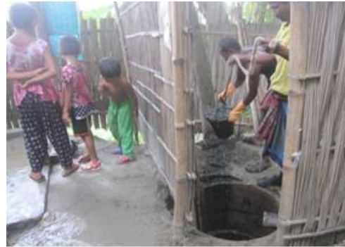
Photograph 2. Manual pit emptying by private sweepers