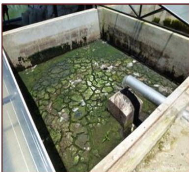
Figure 1. Sand gravel bed