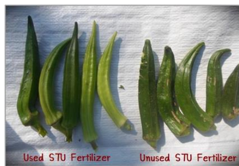
Figure 5. Fertilizer test results