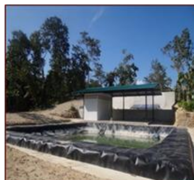
Figure 2. Effluent storage pond