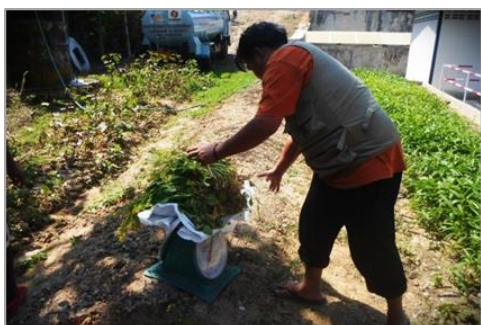
Figure 4. Fertilizer experiment plot