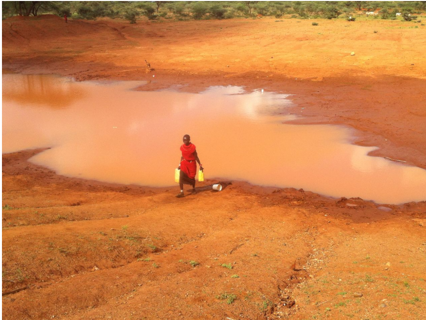
Photograph 1. Woman in Wamba Sub-County collecting water from a pan