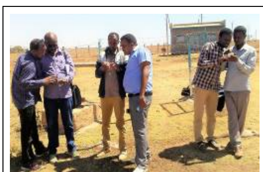
Photograph 1. Data collection training for the SFI in Somali region

The goal, based on the November 2017 workshop, is a regional wide system for monitoring Afar's key domestic water supplies (covering at least all motorised boreholes) with sensors ensuring continuous updating and improved data leading to improved asset management processes.