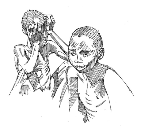
Figure 2. The worsening health of the population is a reason for external organizations to get involved

population are unable to deal with the situation themselves and if the health of the population is getting (or is likely to get) worse (Figure 2). Tables 1 and 2 present health data that will assist in deciding whether or not to intervene.