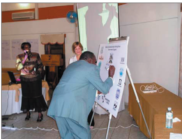
Photograph 2. One of the key stakeholders signing up for the TFR Forum