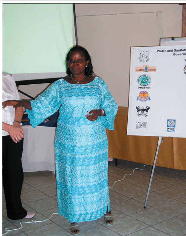
Photograph 1. The Ugandan Minister for Water, Hon Maria Mutagamba, opening the TFR Forum