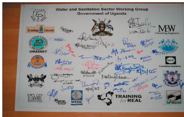
Photograph 3. Key stakeholders from the WSS sector and Higher Education Institutions have signed up TFR Forum Commitment Board